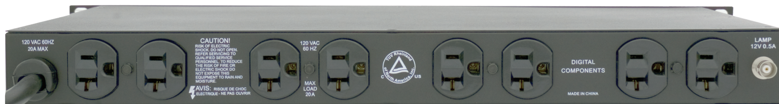
Rear panel identical on all models.

When voltage rises to extreme levels because of a lost neutral line or an accidental connection to 208 or 240 VAC, Furman's Extreme Voltage Shutdown kicks in, automatically powering down all equipment quickly and safely in order to prevent damage from occurring. An indicator LED will then illuminate, alerting you to the situation until the over voltage condition is corrected.